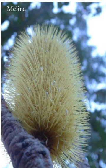
ABOVE: Banksia dentata and RIGHT: Hibiscus meraukensis in Litchfield National Park (Tjaetaba Falls

This tooth leaved Banksia ( Banksia dentata or Swamp banksia) is the only Banksia in the Top End. It grows between 5 and 7m tall and usually flowers from December - April although may flower in months either side (this photo taken in early May). Fruits from July – September, tolerates poor soils and seasonal waterlogging.